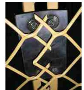
Shooting door Hinge o/s blind. Hinge inside. End door - from outside