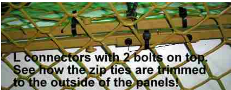
L connectors with 2 bolts on top. See how the zip ties are trimmed to the outside of the panels!

Below: End with door & triangles..... Door latch from inside.