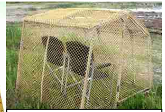
Pond edge, ready for bungee & natural materials used for camouflage